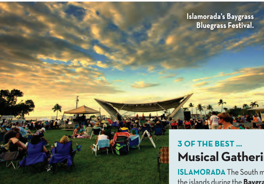
Islamorada's Baygrass Bluegrass Festival.